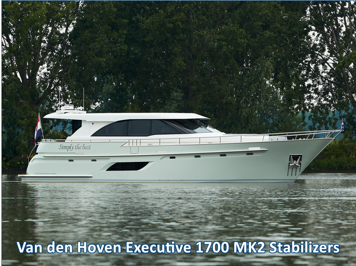
Van den Hoven Executive 1700 MK2 Stabilizers