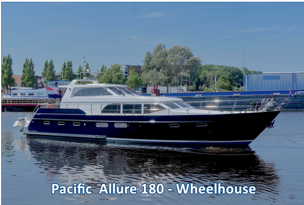
Pacific Allure 180 - Wheelhouse