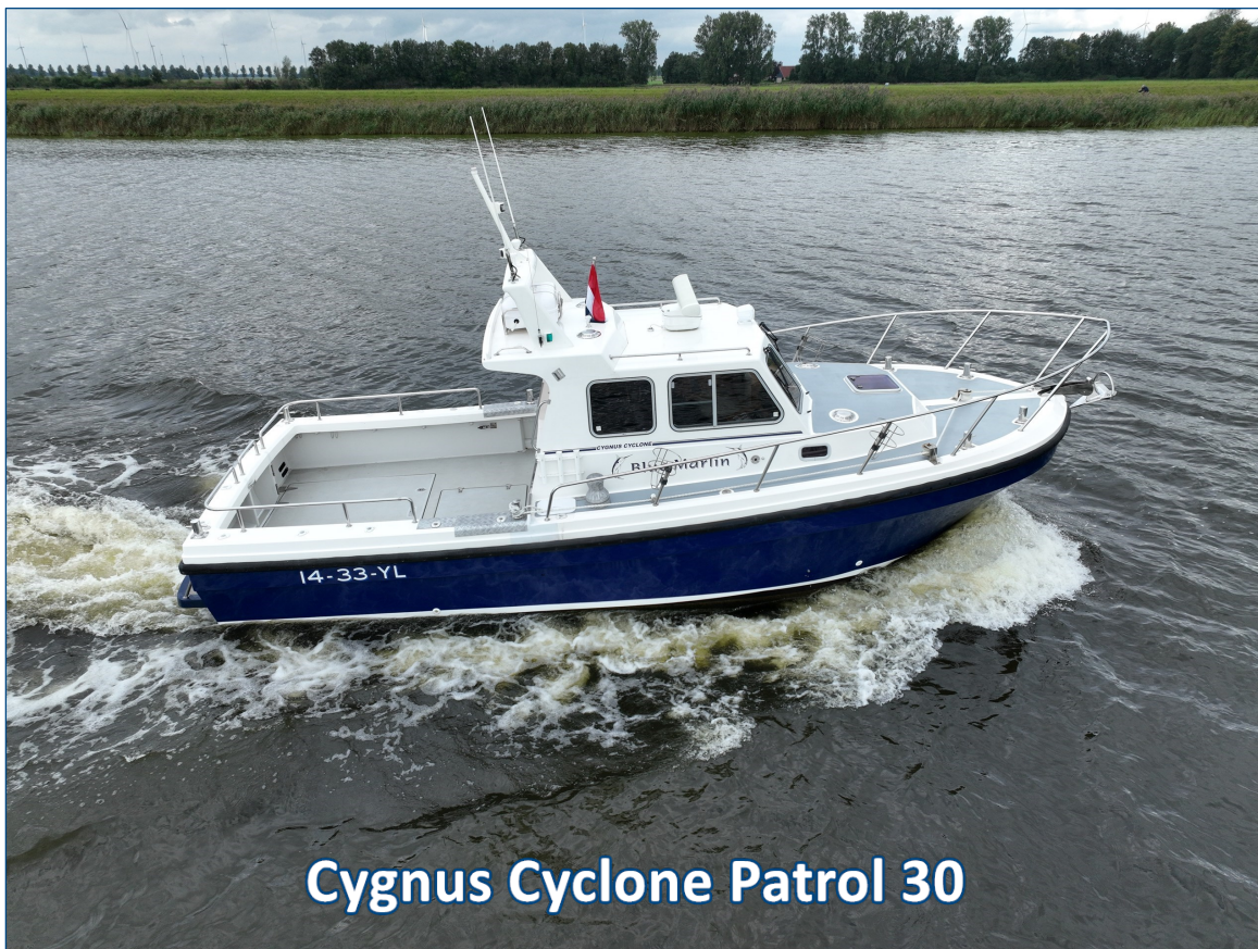
Cygnus Cyclone Patrol 30